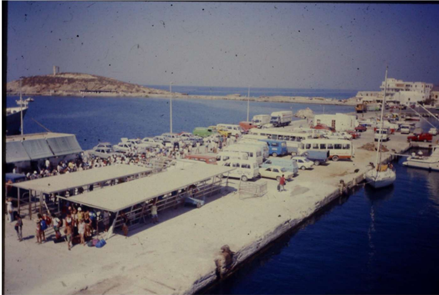
Figure 2 Naxos Port in the 90s

In Greece, there is a word 'philoxenia', which roughly translated means befriending strangers. Greek people, especially in rural areas take this responsibility very seriously. Sometimes at supper, mysterious