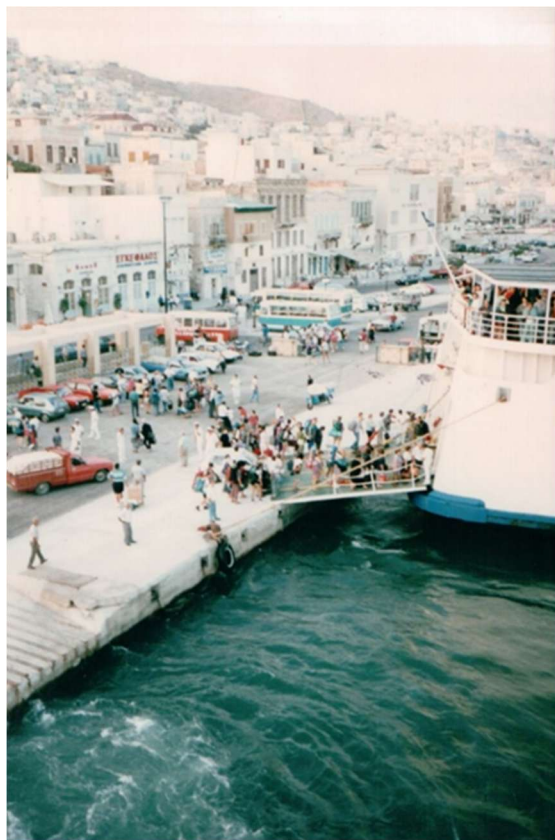
Figure 1 Syros Port in the 90s

Jacky looks back on Greek island life in 1996